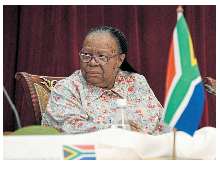
Concern: International relations & co-operation minister Naledi Pandor wants the government to consider more steps against Israel to signal concern about threats to Palestinians.